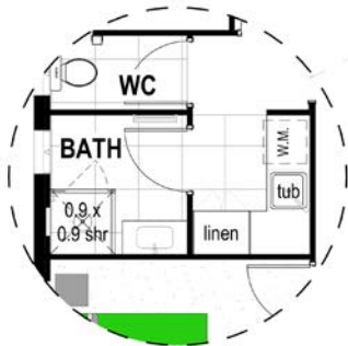
OPTIONAL BATH / LAUNDRY LAYOUT