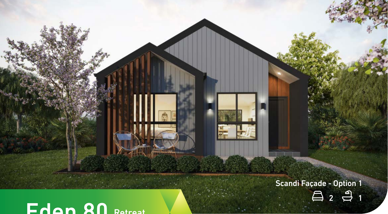
Scandi Façade - Option 1