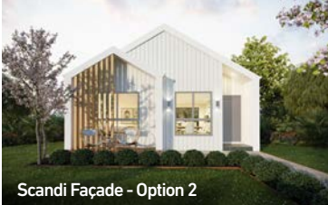
Scandi Façade - Option 2