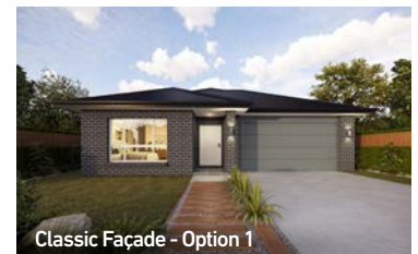
Classic Façade - Option 1