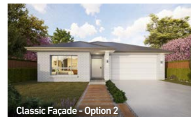
Classic Façade - Option 2