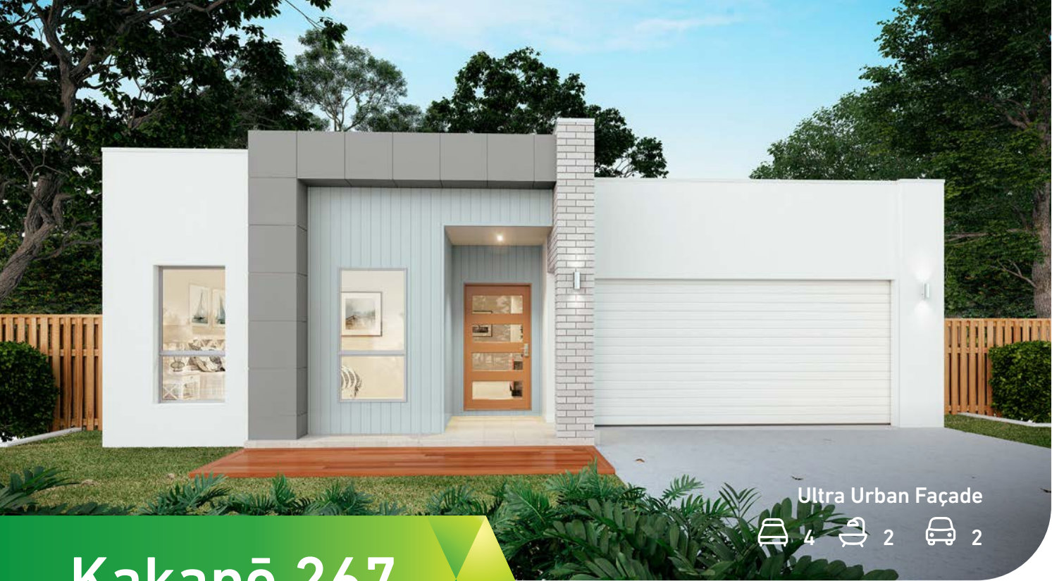
Ultra Urban Façade