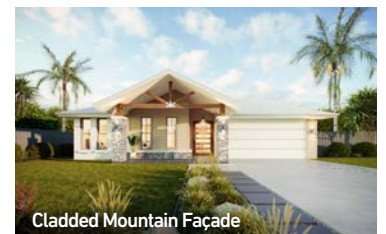
Cladded Mountain Façade