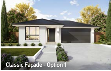
Classic Façade - Option 1