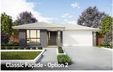
Classic Façade - Option 2