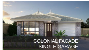
COLONIAL FACADE - SINGLE GARAGE