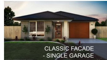
CLASSIC FACADE - SINGLE GARAGE