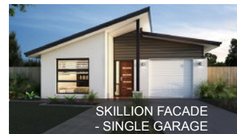
SKILLION FACADE - SINGLE GARAGE