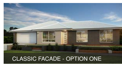
CLASSIC FAÇADE - OPTION ONE