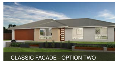
CLASSIC FAÇADE - OPTION TWO