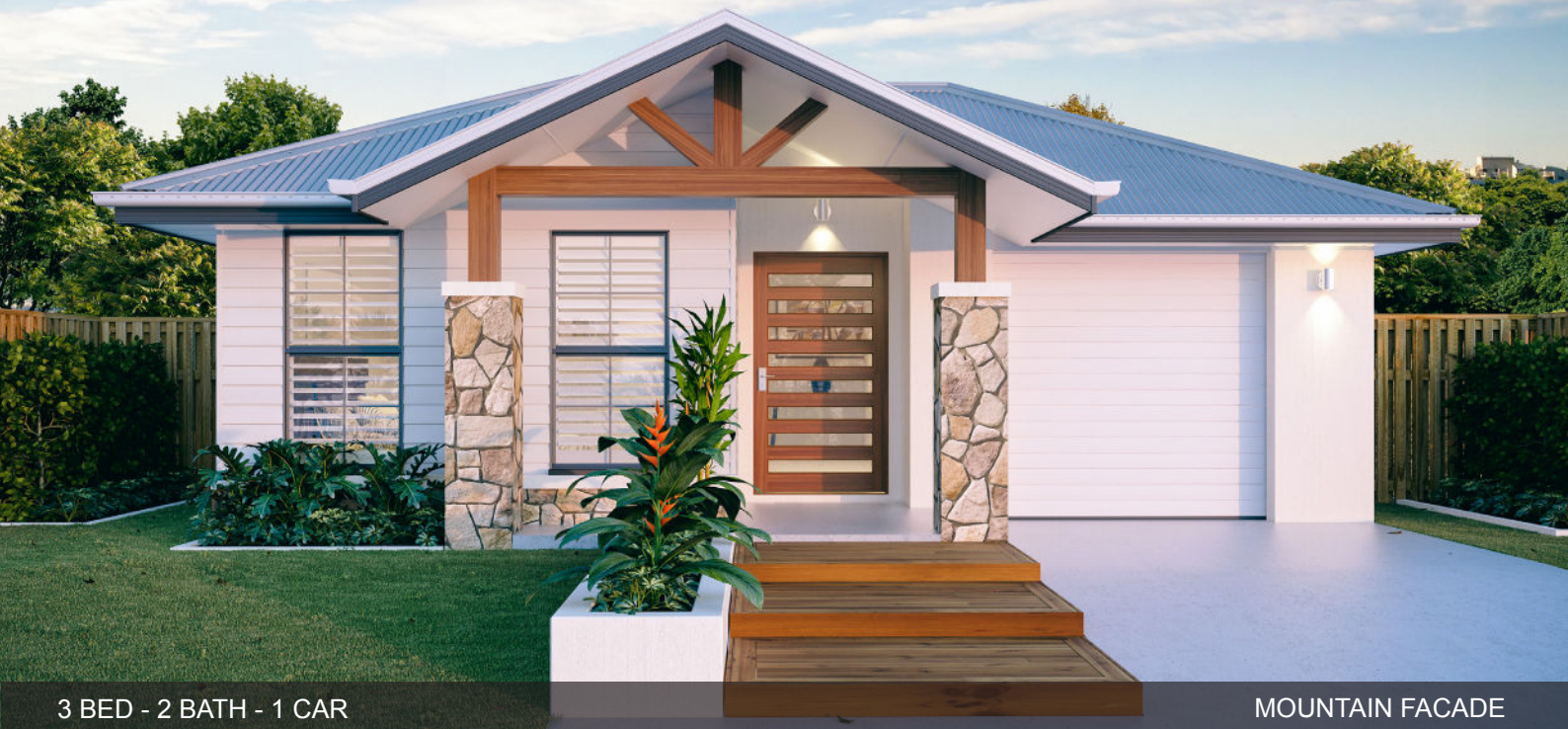
3 BED - 2 BATH - 1 CAR