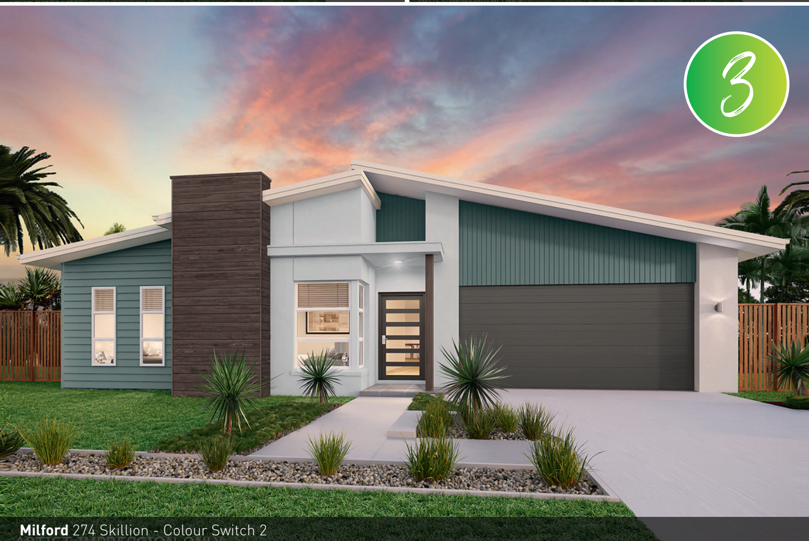
Milford 274 Skillion - Colour Switch 2