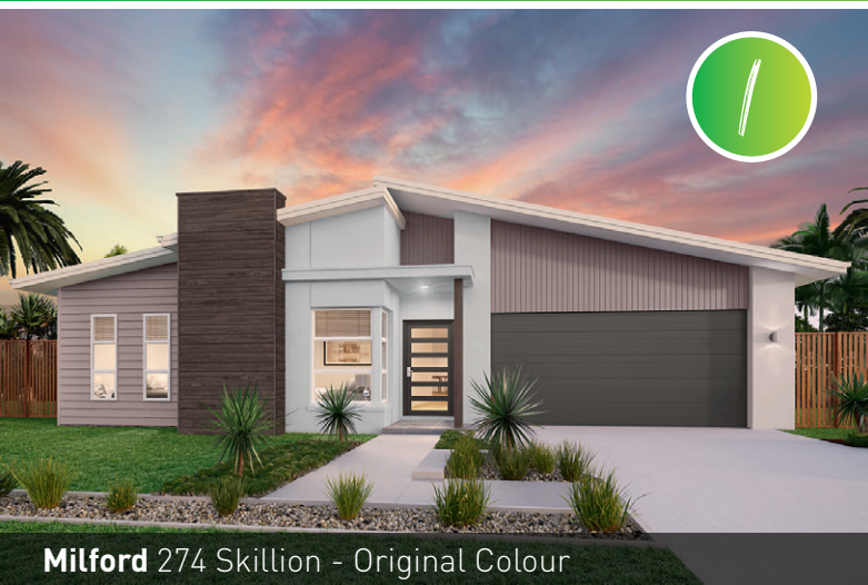
Milford 274 Skillion - Original Colour