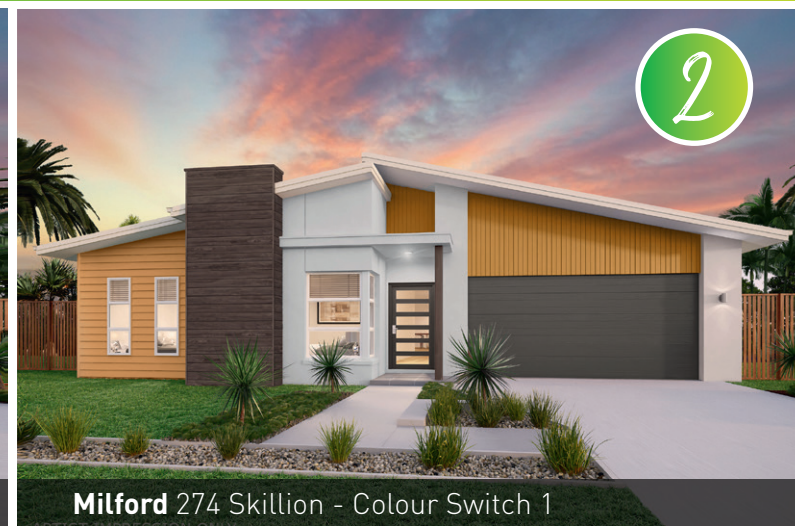
Milford 274 Skillion - Colour Switch 1