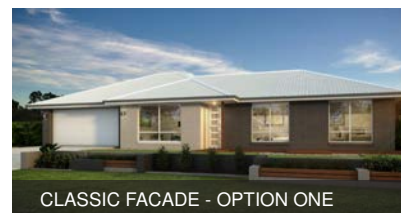
CLASSIC FAÇADE - OPTION ONE