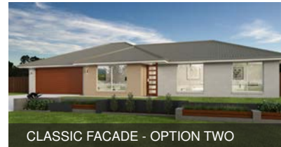
CLASSIC FAÇADE - OPTION TWO