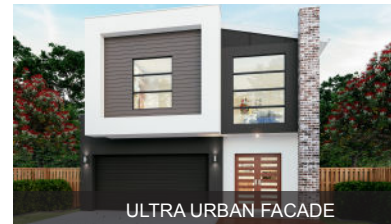
ULTRA URBAN FAÇADE