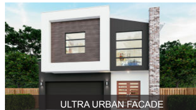
ULTRA URBAN FACADE