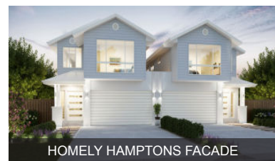
HOMELY HAMPTONS FACADE