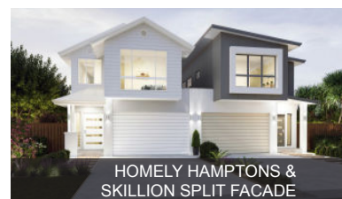
HOMELY HAMPTONS & SKILLION SPLIT FACADE