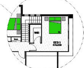
UPPER BED A OPTION