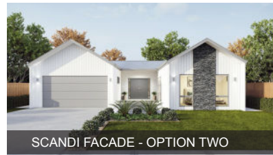
SCANDI FAÇADE - OPTION TWO