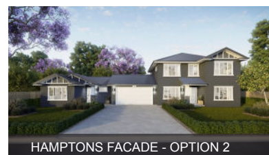
HAMPTONS FACADE - OPTION 2