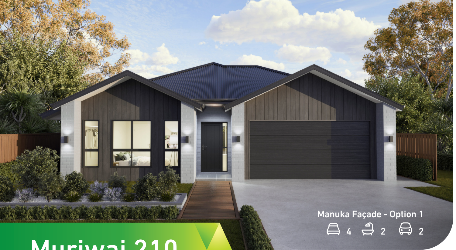
Manuka Façade - Option 1