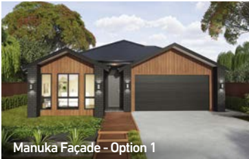
Manuka Façade - Option 1