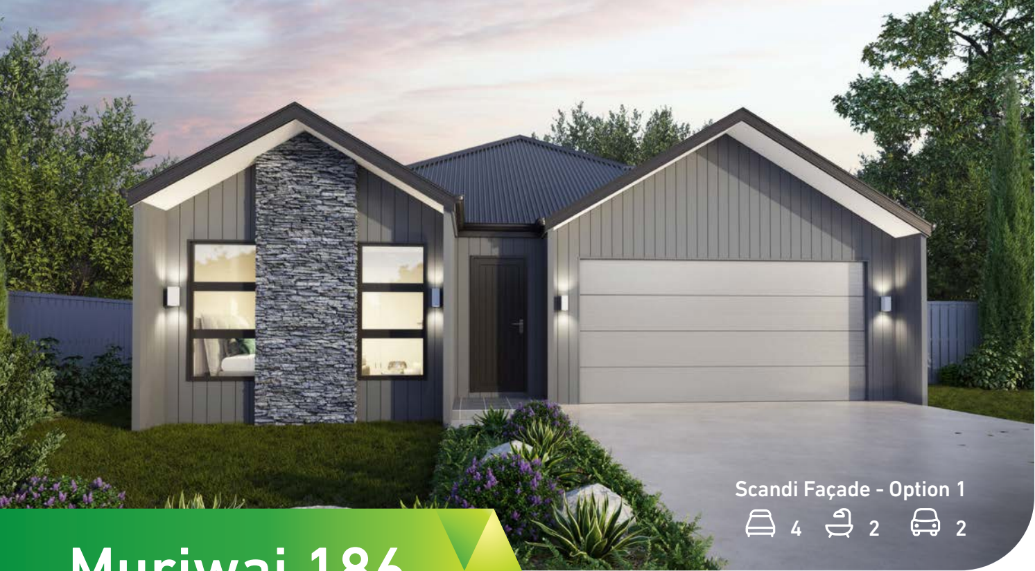
Scandi Façade - Option 1